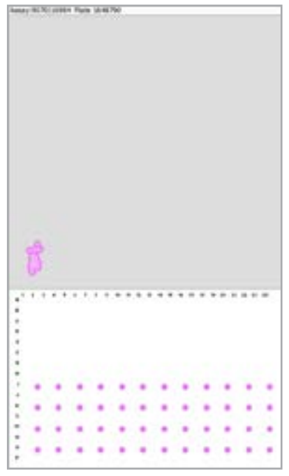
3b. Genotyping data generated with samples dispensed using re-used tips washed with oKtowash:

No amplification, showing no DNA carryover