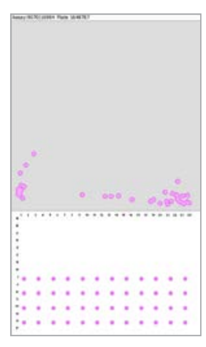
3c .Genotyping data generated with samples dispensed using re-used tips washed with water only :

No amplification, showing no DNA carryover