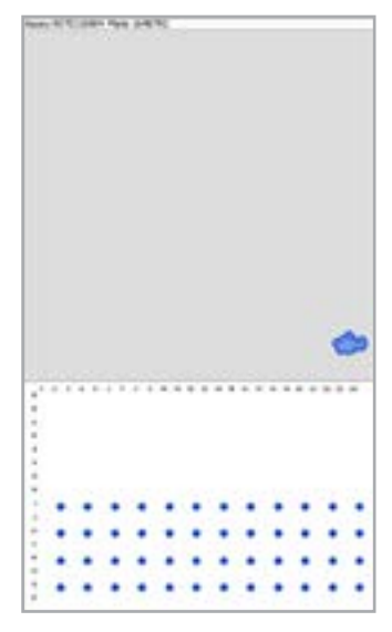
4a. Genotyping data generated with samples dispensed using re-used tips washed with oKtowash:

Tight clustering of positive amplification signal, showing no inhibition.