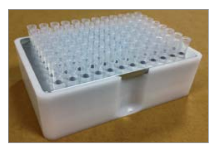
Figure 2: The oKtopure wash station