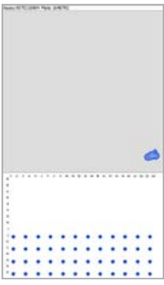
4b.Genotyping data generated with samples dispensed using re-used tips washed with water only:

Tight clustering of positive amplification signal, showing no inhibition.